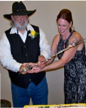
Cutting the Cake